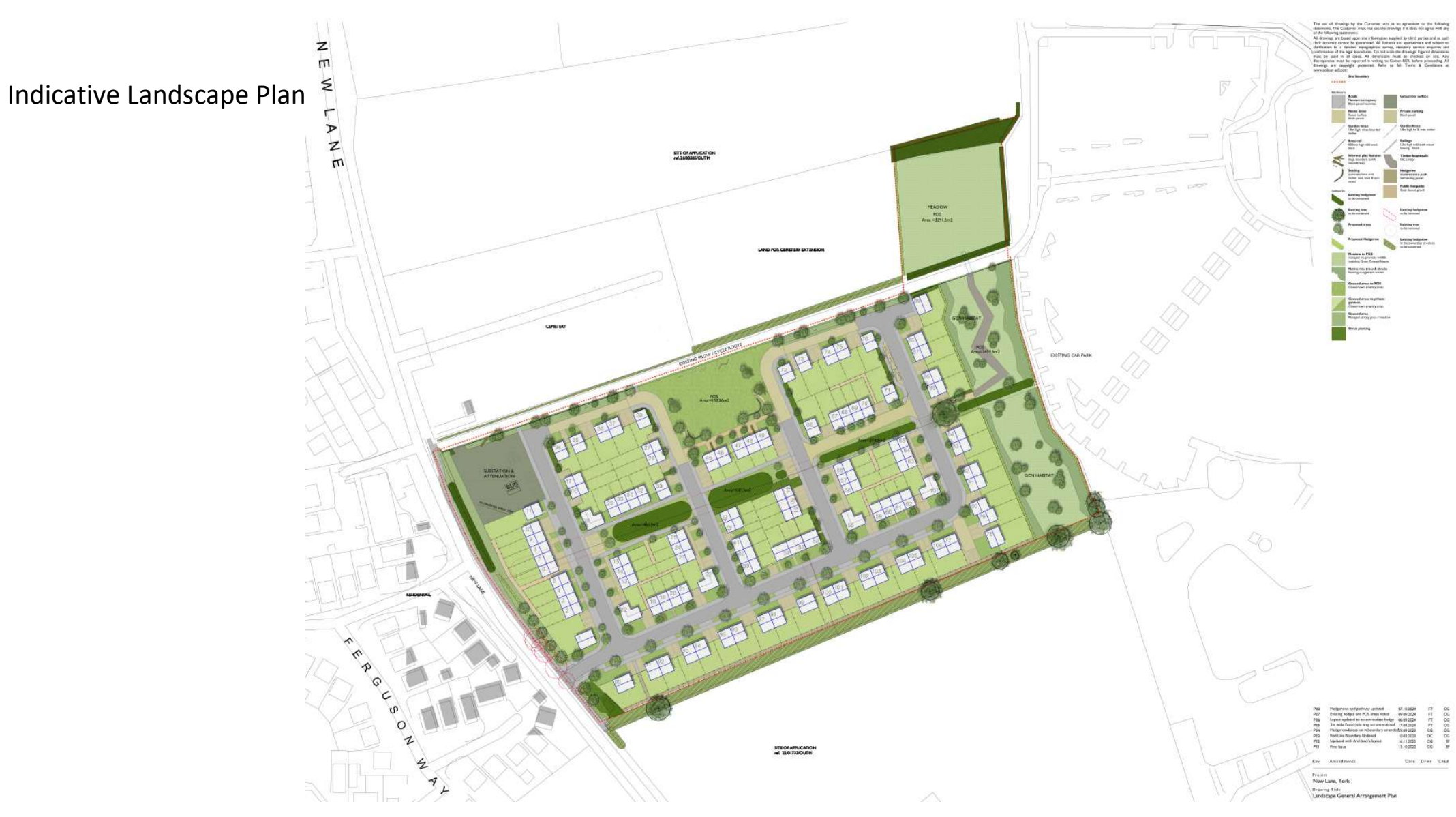
Planning Committee A Meeting - 7 November 2024